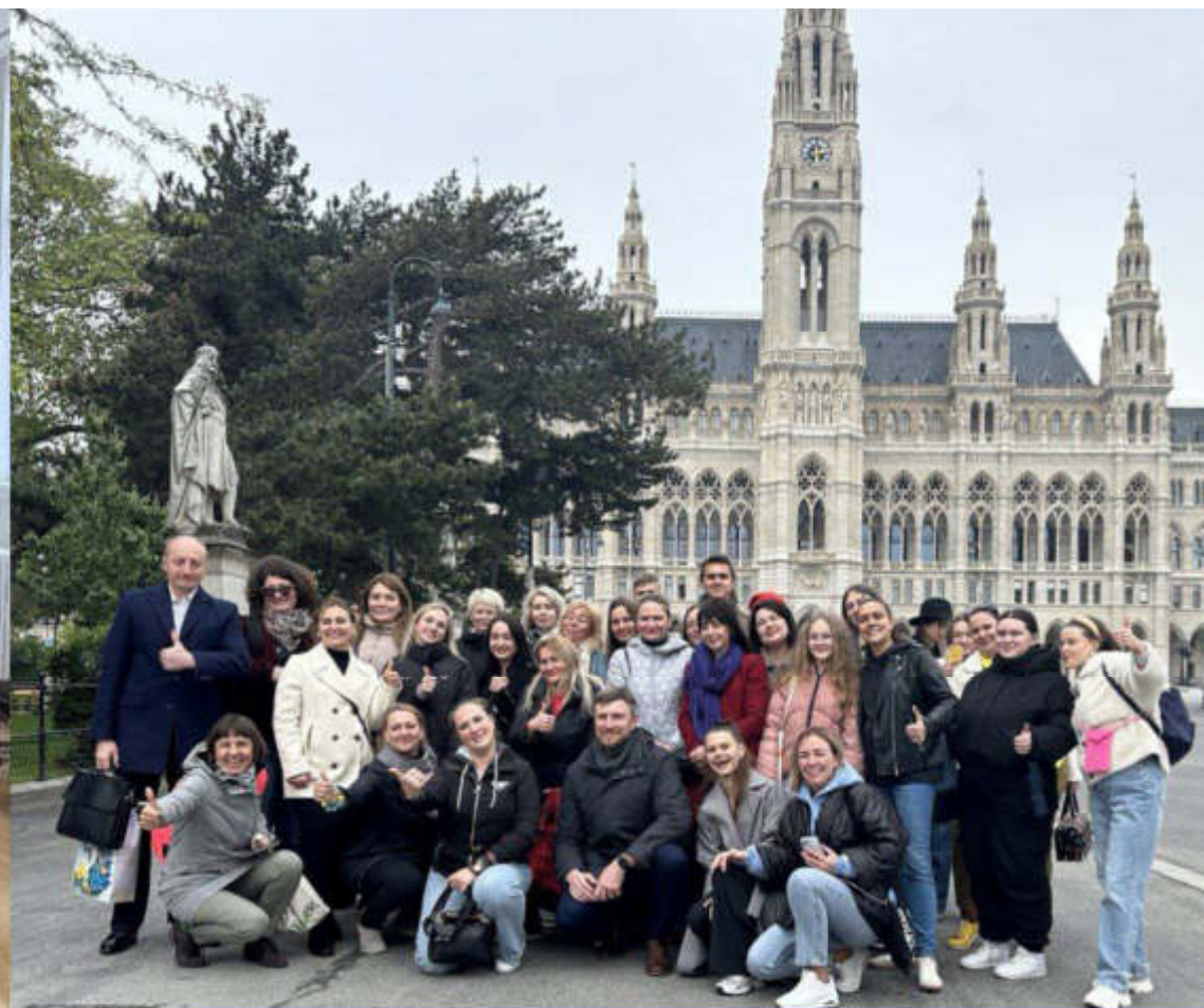
Training on Youth Work with Ukrainian Displaced Youth in Vienna, Austria