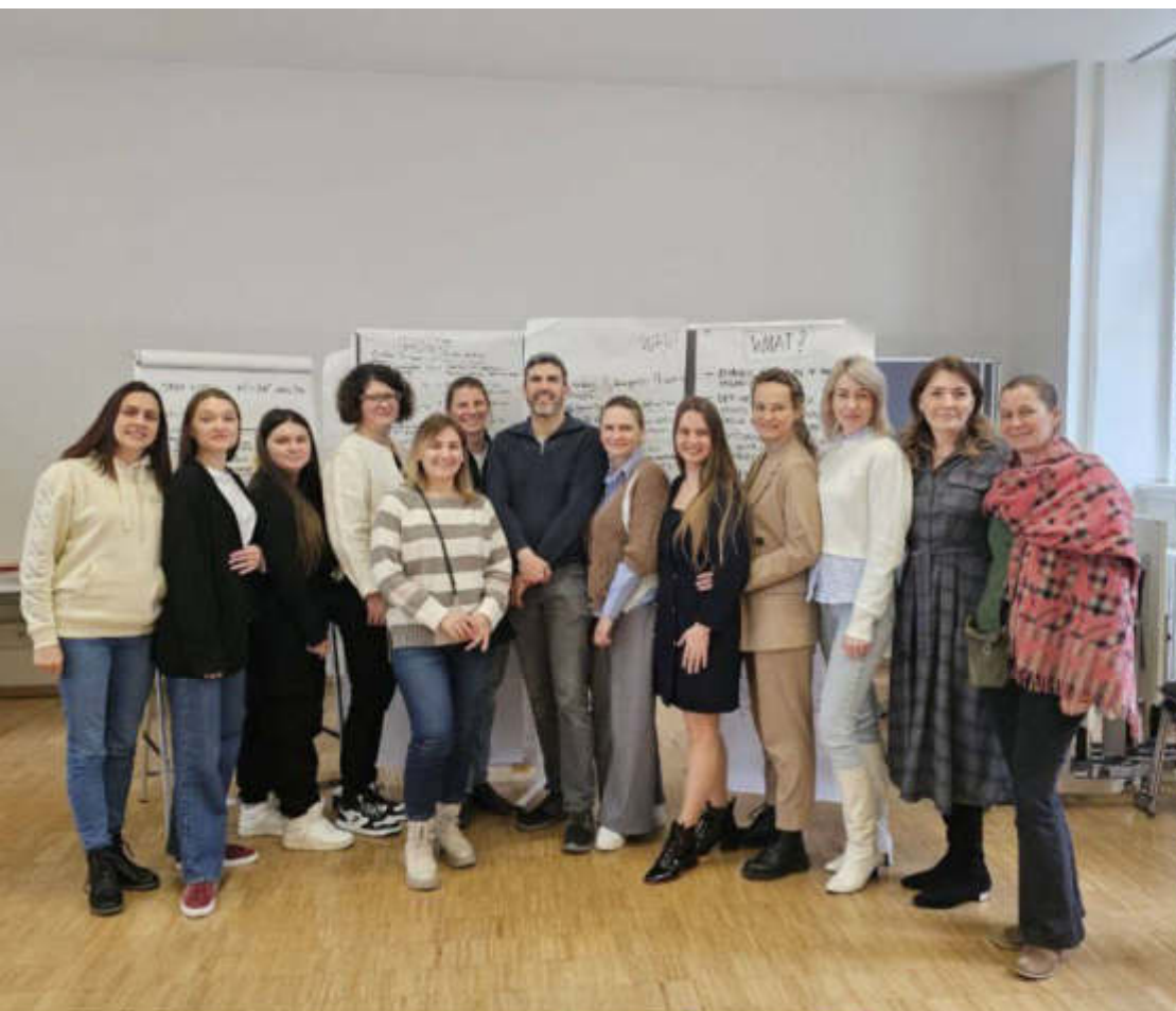
Preparatory Meeting of Project Partners in Vienna, Austria